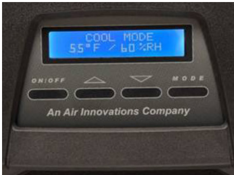
Front Digital Display