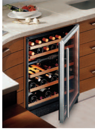
JG 51 - an integrated model. Adequate ventilation is required for all built-in models.