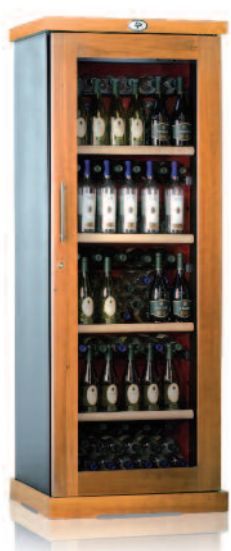
CEX801 - Wood model with glass door and multi temperature.