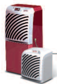
Wine SP100 & SP100-8