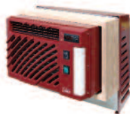
Wine C50S, C50SR