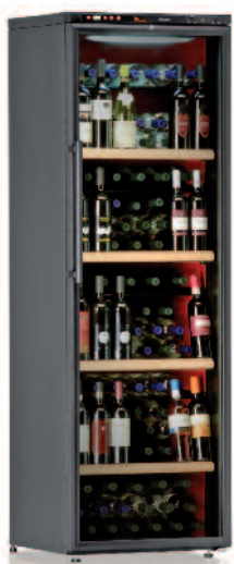
C501 - Multi or mono temperature black enamelled model with glass door.