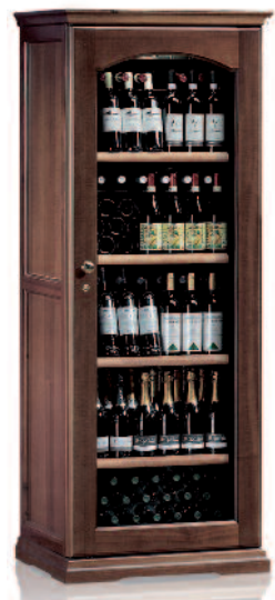
CEX501 - Wood model with glass door.