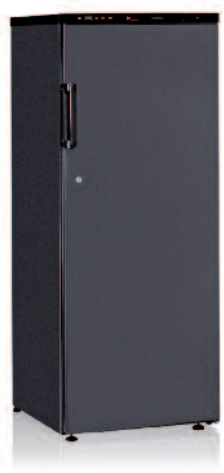
C300 - Multi or mono temperature black enamelled model with solid black enamelled door.